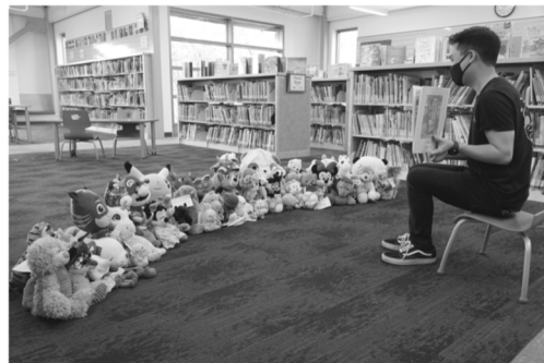
STUFFED ANIMAL SLEEPOVER!