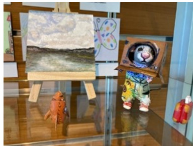
Tiny Art originals pictured here include modeling clay and acrylic on canvas.

The community is enjoying the exhibit of acrylic, oil and watercolor paintings, clay and stone creations, figures made from wire, wool, papier-mâché, and more. We hosted an artists' reception on September 10 and over sixty people came to admire and celebrate our wonderful, artful community. We hope to welcome even more submissions in 2024!